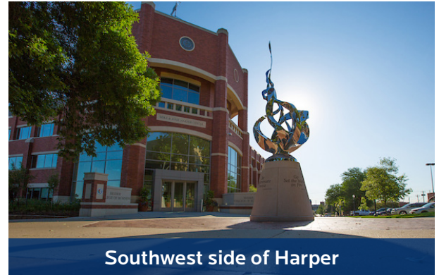
Southwest side of Harper

*If the visitor's parking lot is full, you may park on the top floor of the Harper parking garage, just south of the visitor's lot. Signs indicate faculty/staff parking only. Disregard these; you are welcome to park here. If the parking gate is not raised, call us at 402-280-2703 and we will raise it for you. On the rare chance that you get a parking ticket, contact us and we will take care of it for you.