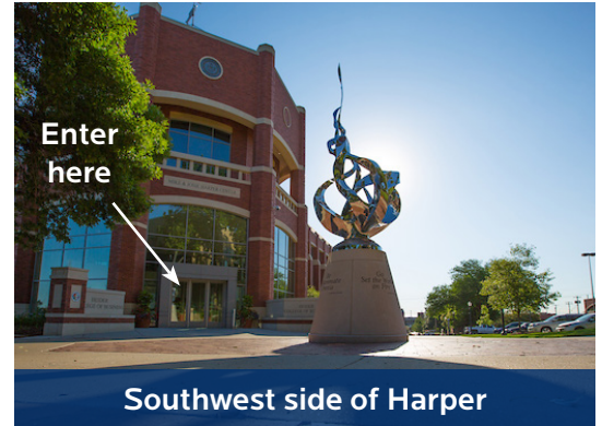
Southwest side of Harper

*If the visitor's parking lot is full, you may park on the top floor of the Harper parking garage, just south of the visitor's lot. Signs indicate faculty/staff parking only. Disregard these; you are welcome to park here. If the parking gate isn't raised, call us at 402-280-2703 and we will raise it for you. On the rare chance that you get a parking ticket, contact us and we will take care of it for you.